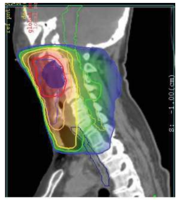
DOSE DIFFERENCE (EXCESS RADIATION FROM X-RAYS)